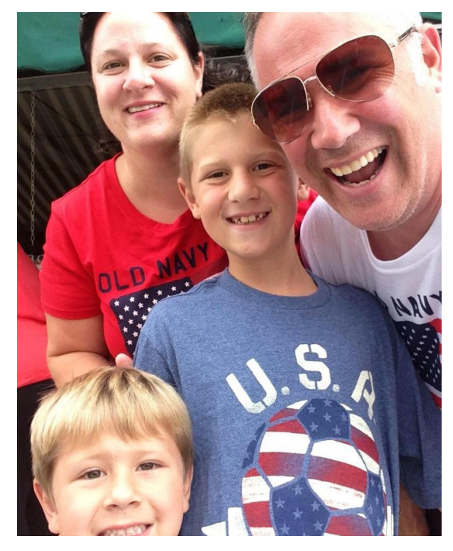
THIS IS US

PS We have a guidebook on AirBNB as well please check that out it shows things to do around the Hollow